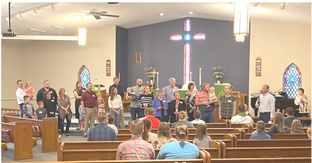
We welcomed five new families to St. Peter at our New Member Sunday on October 2.