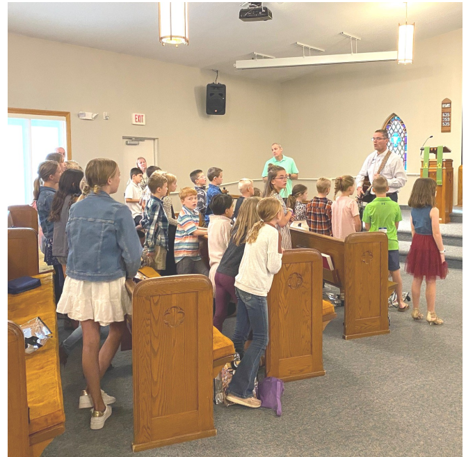
Children enjoy their Sunday School curriculum and opening music.