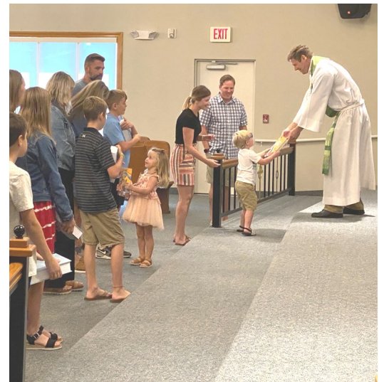
Sunday School children received their first communion, and 5th graders and 3-year-olds received Bibles.